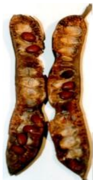
Carob pod split open

The polysaccharide from the endosperm is a long chain \beta -(1-4)-mannose polymer with \alpha -(1-6)-galactose units appearing as single unit side chains. This puts the galactomannan in the same general family as other polysaccharides such as guar, fenugreek, tara and cassia. The ratio of galactose to mannose in LBG is roughly 1:4. The distribution is believed to be roughly random although this area has not been adequately investigated in terms of relating structure to variety. Recent work by Henk Schols at Wageningen in the Netherlands (11th Wrexham conference) has shown that there are considerable variations across a selection of LBG sources. However the work was flawed by not identifying the source of each LBG sample in terms of variety, region and farming/harvesting conditions, but the main point, that there are differences, was proved. However the techniques exist to elucidate the structure of a galactomannan (Mc Cleary) and it would be extremely useful to identify structural variations between varieties or farming/harvesting conditions and relate this to functional properties such as synergism with other gums and performance in end use applications.